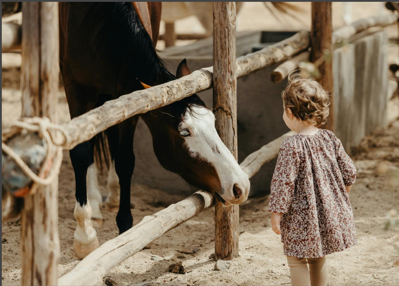
Hakansson, E. (2024). Sub-Human. Lantern Press.